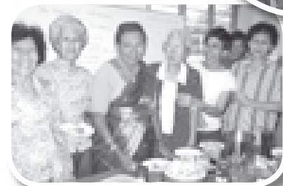
Celebrating her 80th birthday with the patchwork gang