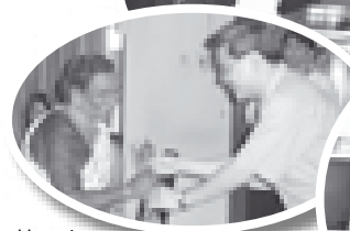
Hospice Day celebration