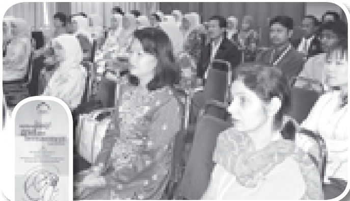
Workshop at Hospital Permaisuri Raja Bainun Ipoh

The lesson to learn is that when we are prepared for death, life is better for ourselves as well as our loved ones.