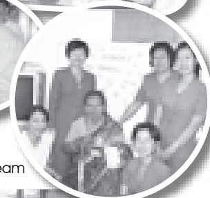
With PPCS medical team