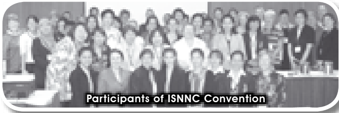
Participants of ISNCC Convention