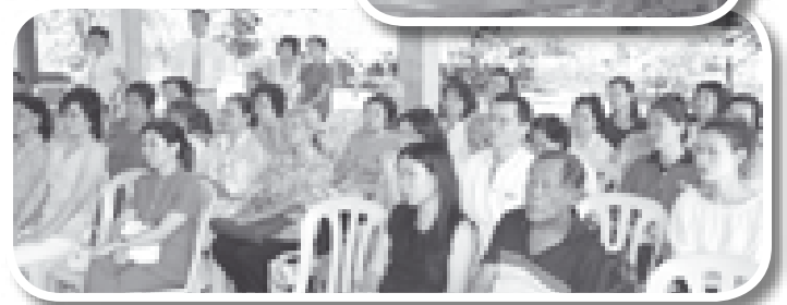
Memorial service at Taiko Garden

social workers and paramedics from all government hospitals in the State of Perak. The workshop introduced updated theories and models in bereavement care. Assessment and grief intervention with bereaved persons and families were discussed through case studies as well as video clips. Practical tips were shared on working with Anticipatory Grief and Acute Grief Support.