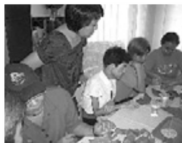
Patients and volunteers engrossed in making CNY decorations