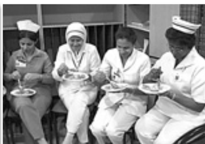
Ipoh Hospital nurses, "tucking in"