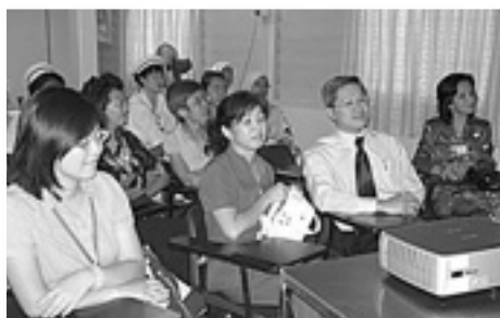
Participants listening intently