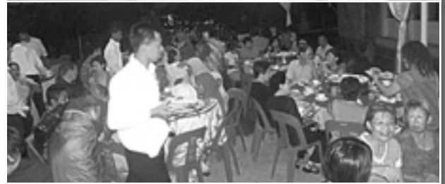
Dinner in progress